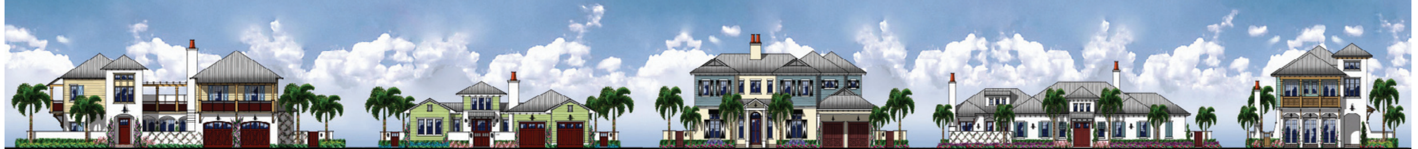
5 Beach Houses | Delray Beach