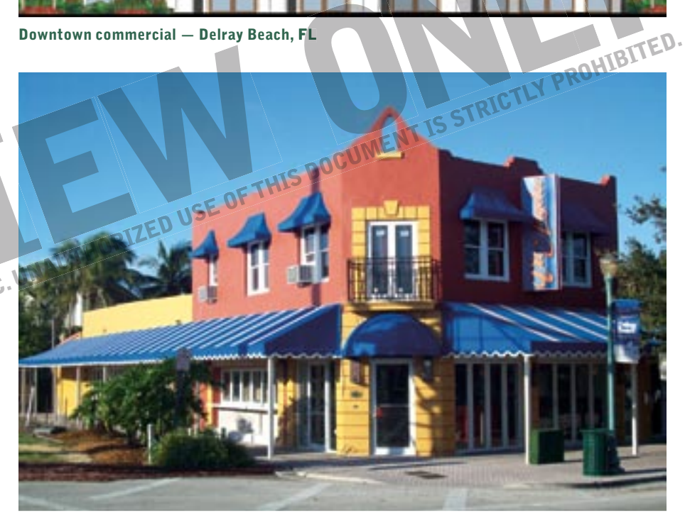
Restaurant — Delray Beach, FL

Senior affordable condos — Boynton Beach, FL